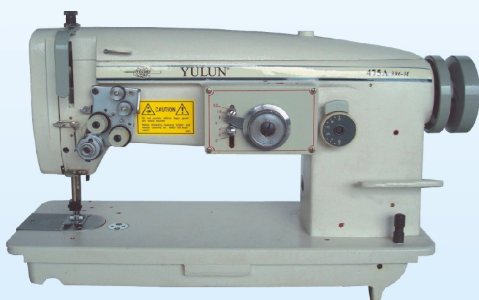
Twin Needles 雙針